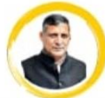
Cabinet Minister, Govt. of Haryana (Minister of Education, Forests, Tourism, Parliamentary Affairs, Art & Cultural Affairs & Hospitality Department, Haryana)